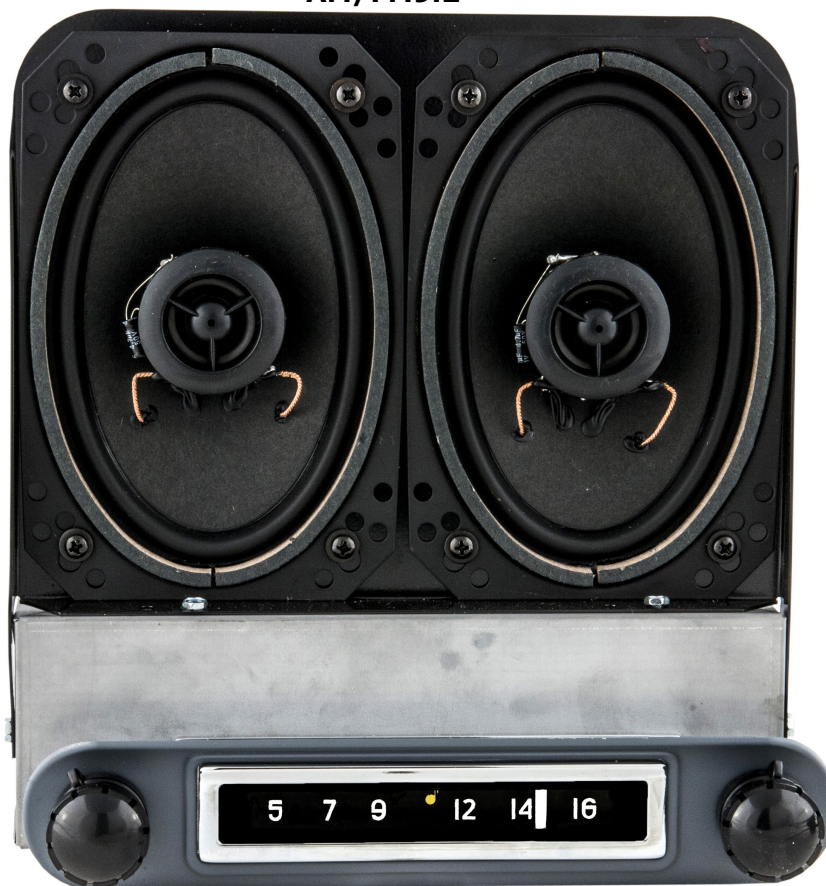
Model 172014B (Radio With Speakers)

Add our Bluetooth® adapter kit option! Answer incoming calls and place outgoing calls with compatible phones — all without having to fumble around for your cell phone. You can also stream music from any compatible phone or tablet — use the dedicated keys to skip or replay tunes. Built in USB 2.1 Amp charger. NFC simple pairing function.