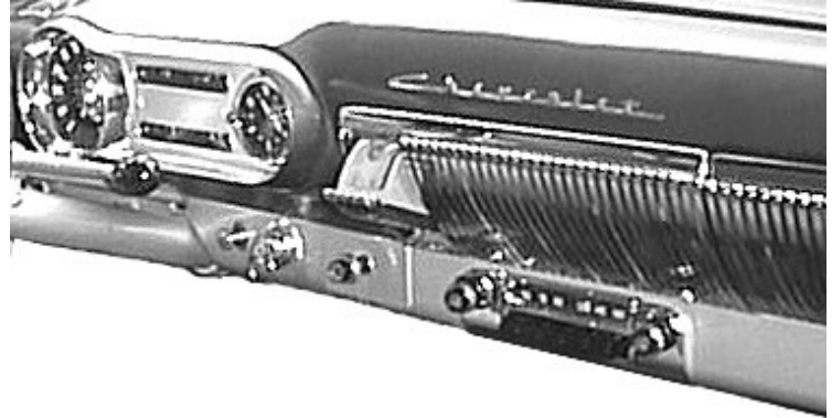
As seen from front of dash