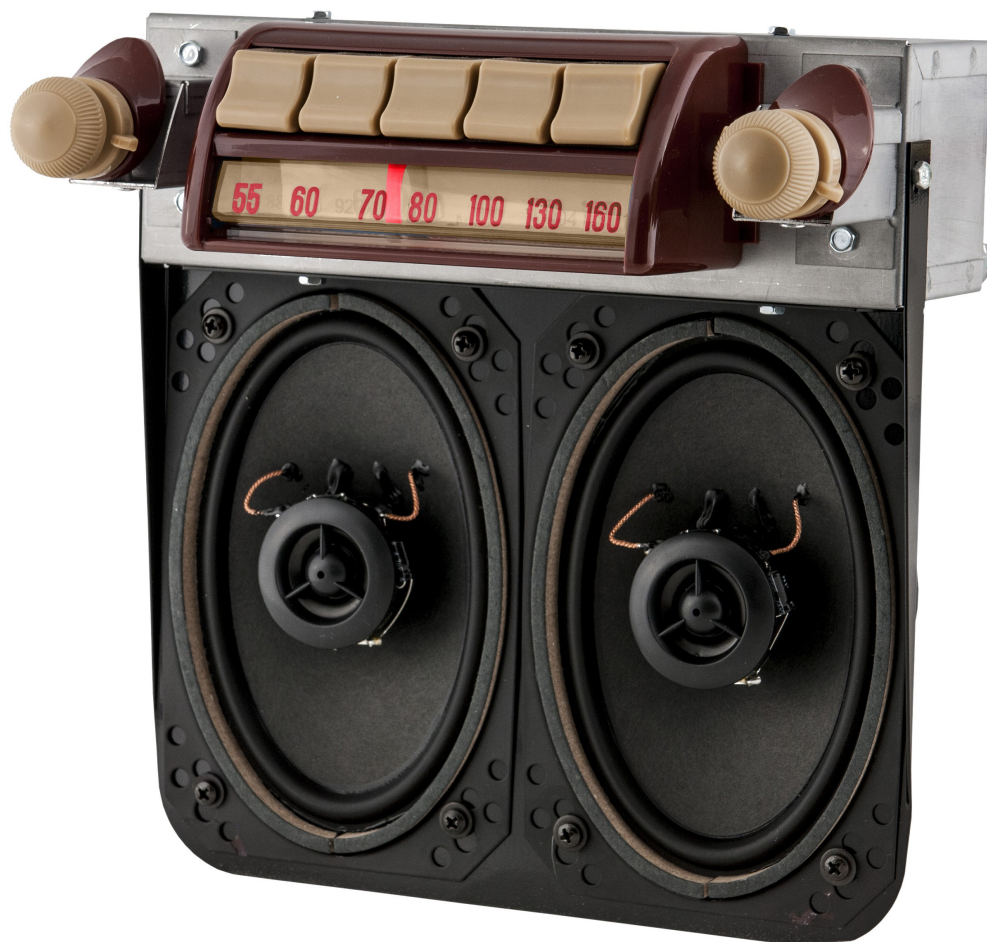
Model 052314B (Radio with speakers)

Add our Bluetooth® adapter kit option! Answer incoming calls and place outgoing calls with compatible phones — all without having to fumble around for your cell phone. You can also stream music from any compatible phone or tablet — use the dedicated keys to skip or replay tunes. Built in USB 2.1 Amp charger. NFC simple pairing function.