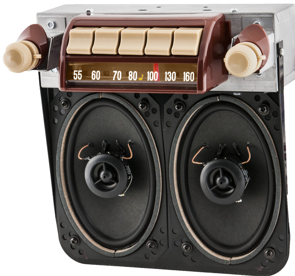
Model 042314B (Radio with speakers)

Add our Bluetooth® adapter kit option! Answer incoming calls and place outgoing calls with compatible phones — all without having to fumble around for your cell phone. You can also stream music from any compatible phone or tablet — use the dedicated keys to skip or replay tunes. Built in USB 2.1 Amp charger. NFC simple pairing function.